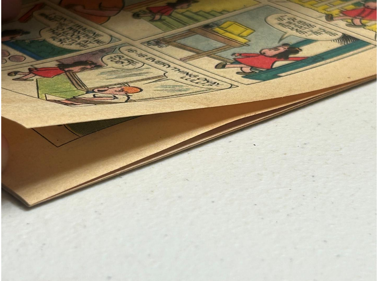
Image clearly shows a single interior page lifted above the underlying pages, with lighting sufficient to observe bend behavior.