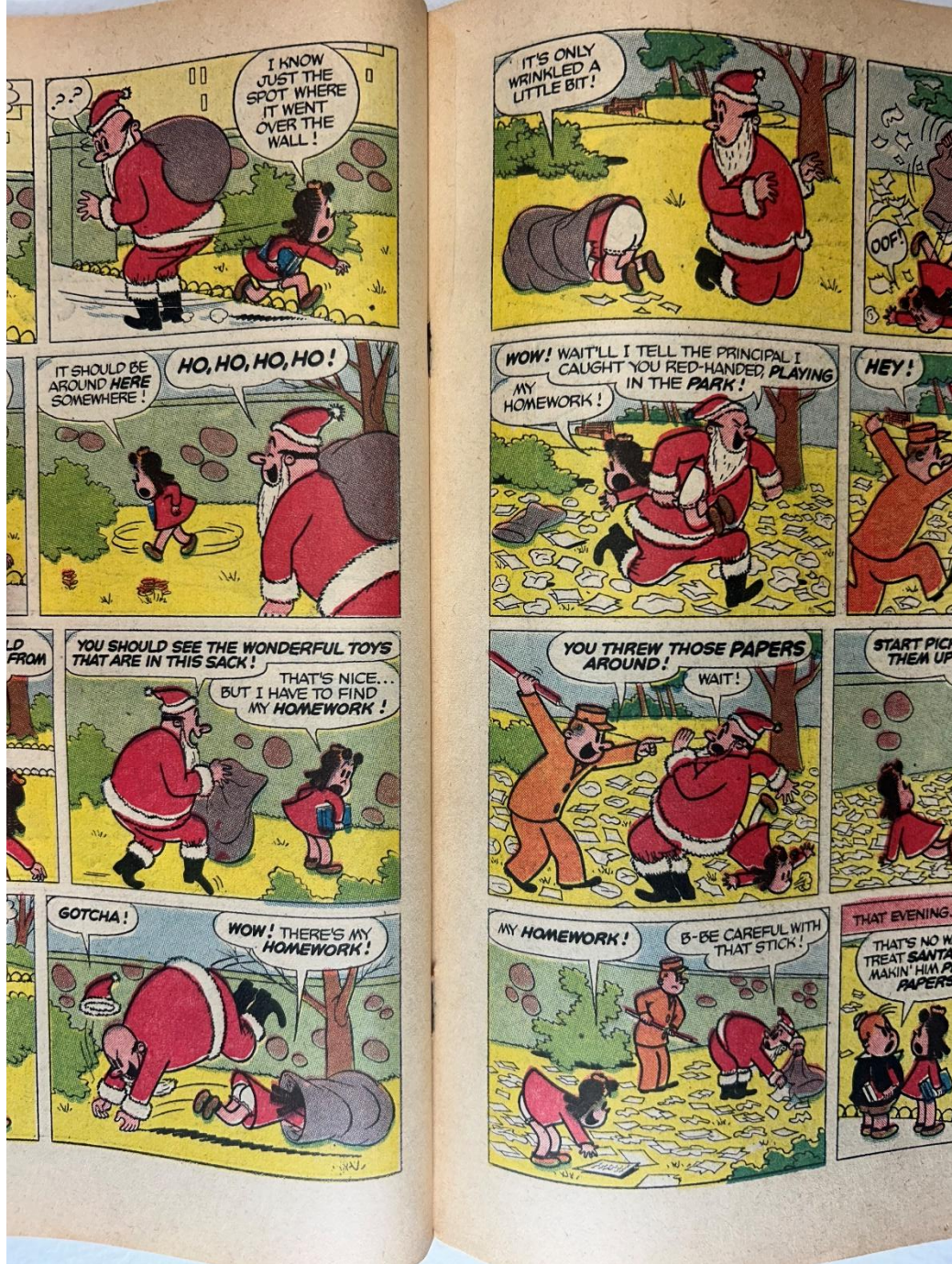
Image is sharp, evenly lit, and clearly framed. Both interior pages and the gutter are fully visible, allowing reliable evaluation of attachment and fold integrity.