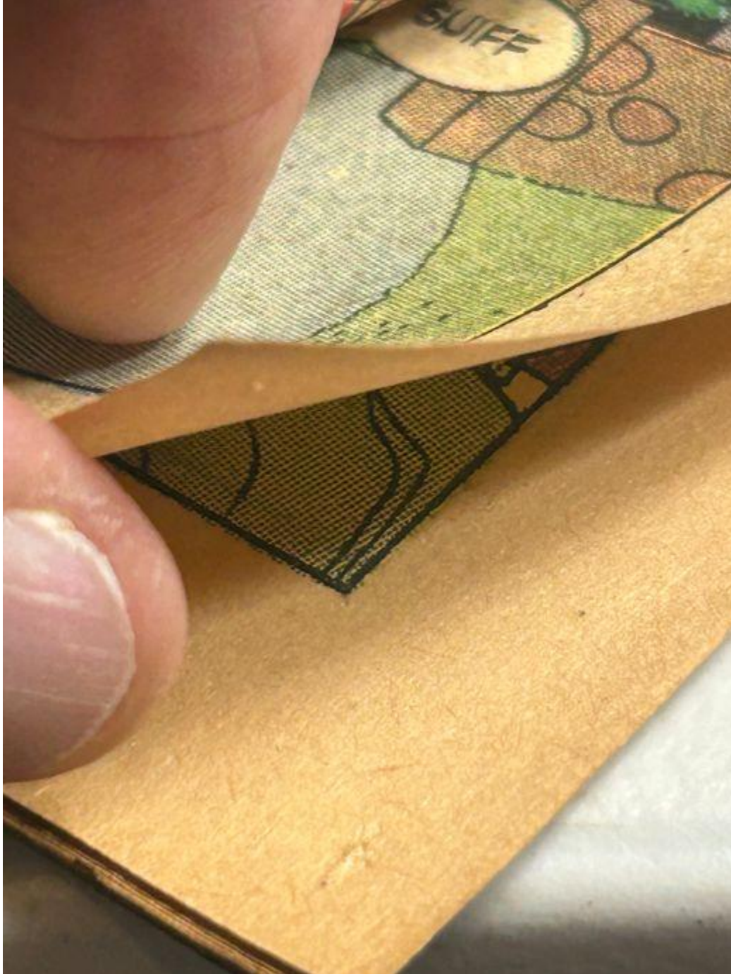
Overall Bend Behavior

Marge's Little Lulu Vol. 1 No. 27 – September 1950